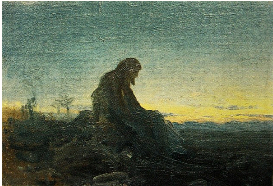
Christ in the Desert by Ivan Kramskoi, 1872

As our community has entered into this new year, we currently find ourselves in the thick of Lent. The liturgical season is one of self denial, fasting, and almsgiving to prepare ourselves as a community for the Easter vigil. As the Pastoral Minister I have chosen to give up screen time, which has proved to be so much easier said than done. For those of us who choose to abstain, we have an endless sea of choices to pick from. Some of us will give up meals, others luxuries we rely upon just a tad too much, and some of us will wring our hands with too many choices to abstain from. The season is a reminder that we have been given days to feast and given days to fast, and the latter is at hand.